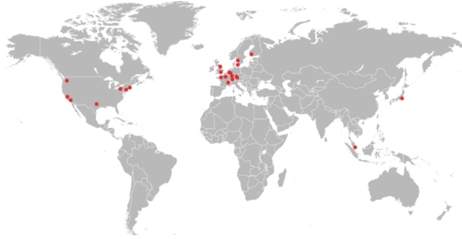
Fig. 1. Geographical distribution of the participants.